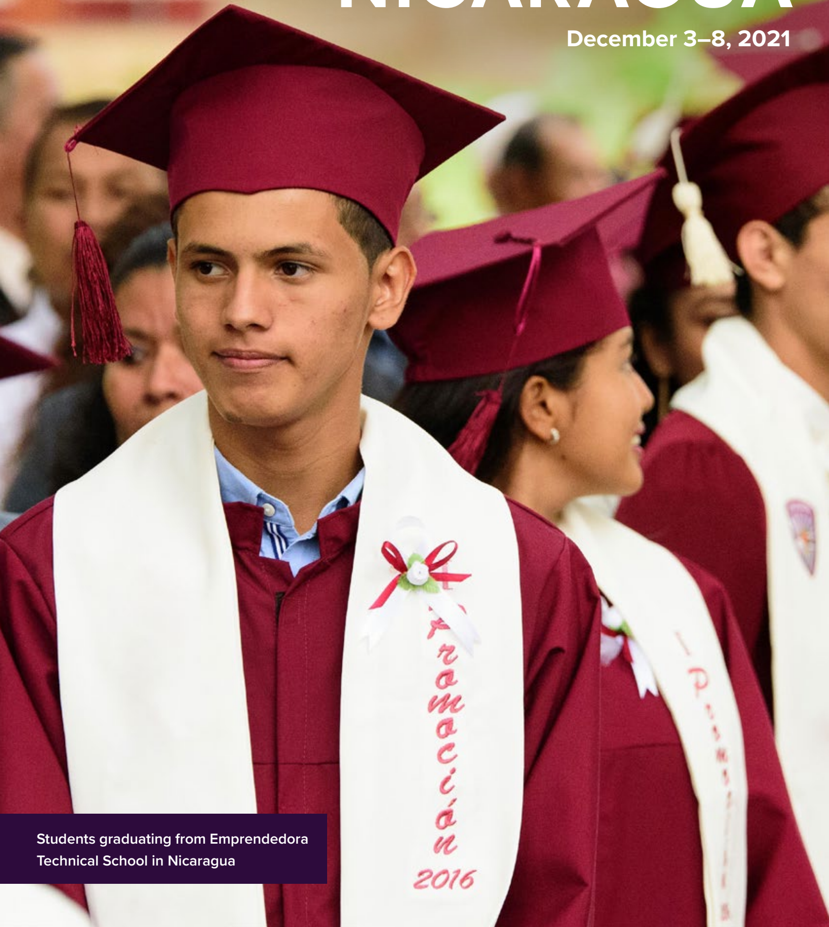
Students graduating from Emprendedora Technical School in Nicaragua