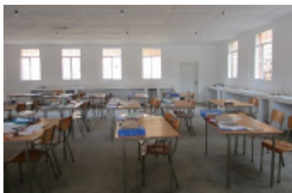
An empty school in Uganda