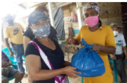
Delivering food in Colombia

Opportunity's Rapid Response to COVID-19 on a global scale is helping to protect clients and their families through this dark time by providing critical information and increased knowledge; delivering food, water, and other basic survival needs; and helping schools and financial institutions stay afloat as loan repayments are disrupted.